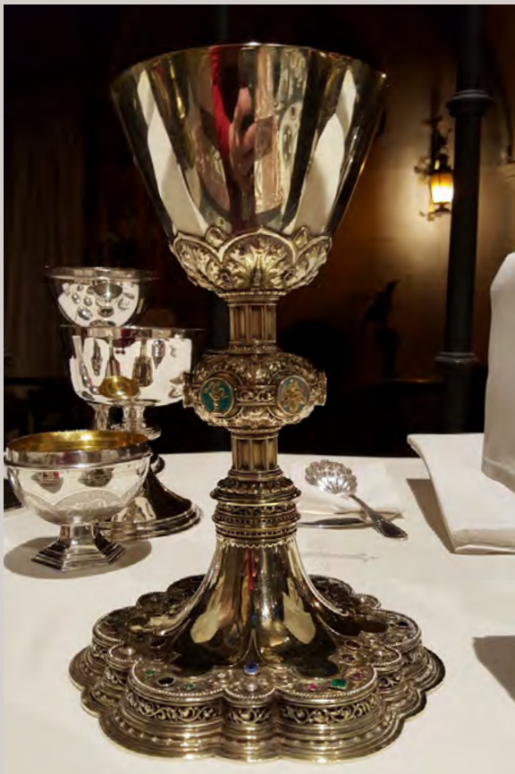
ONE OF THE ORNATE CHALICES USED FOR HIGH FEASTS

The story of the candlesticks reflects in many ways the spirit of stewardship that has existed within the Cathedral community since its inception. Year after year, generation after generation, members of the Cathedral community have contributed to the preservation and development of the Cathedral, though not only of the physical building, as witnessed by the recent major renovation project, but also of its spiritual aspects, through the support of the Cathedral's mission and outreach programs and projects. The candles, supported by the Gothic candlesticks, flicker