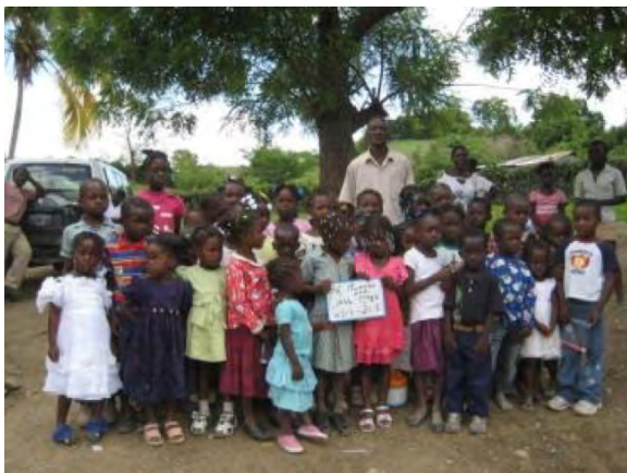
FIRST AND SECOND GRADE CHILDREN IN PACASSE

so that the children may have one hot daily meal and access to quality education. We have visited on multiple occasions, sharing in joyous celebrations with the people of Pacasse. More recently, and with the help of the Mission & Outreach Program of the American