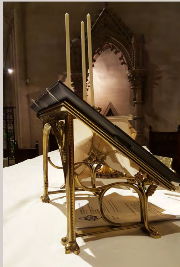
THE ALTAR BOOKREST