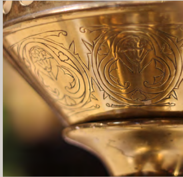
DETAIL FROM ONE OF THE CANDLESTICKS