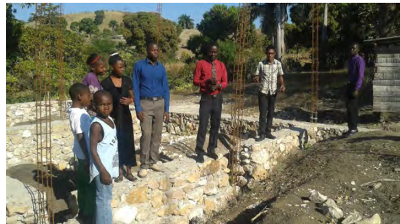
AT THE CONSTRUCTION SITE

Cathedral in Paris, we have begun construction of a school and a well for the community.