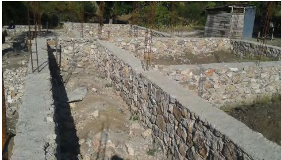
SCHOOL CONSTRUCTION GETS UNDERWAY

these communities was to have an Episcopal “partner” for financial, moral and emotional support. Amélie’s Angels, under the auspices of St. Mark’s, became the official partner of St. Pierre in Pacasse, Haiti. Since January 2014, we have provided quarterly payments